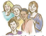
Women of the Church

Jan. 30: RCW ANNUAL MEETING - 7 p.m. All women of the church are welcome to attend.